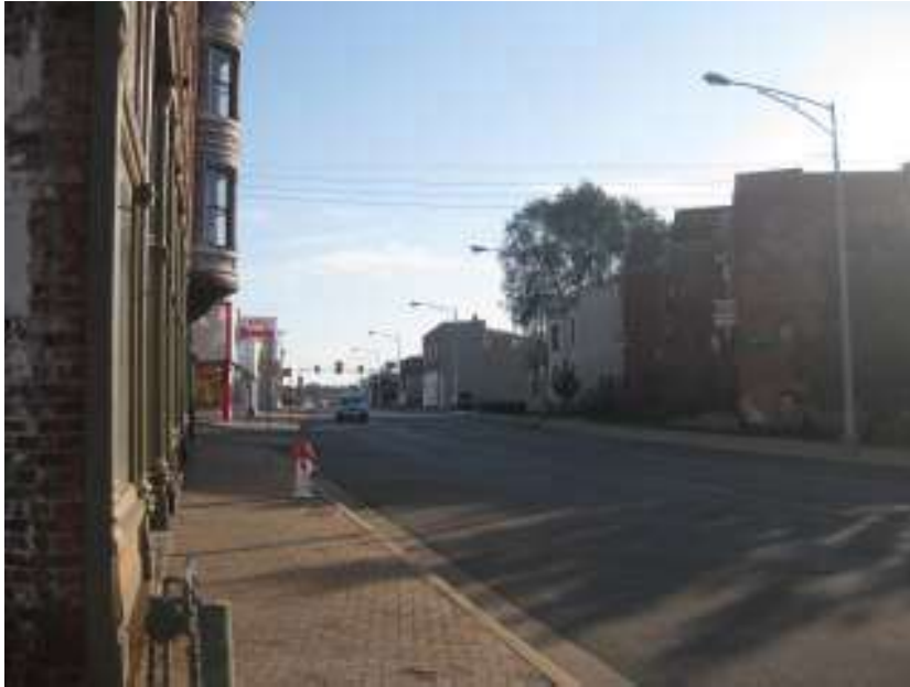
East view of Frederick Avenue; the NR listed Kelley and Brown Flats and Lawler Motor Company are on the right.