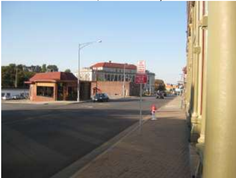
West view of Frederick Avenue; City Hall is towards the back on the left