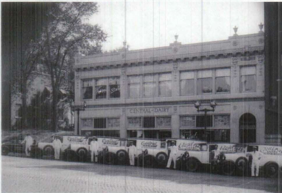
Figure Three. Photo of the building taken in 1930 by Peterson photography, which had an office on the second floor of the building at the time.