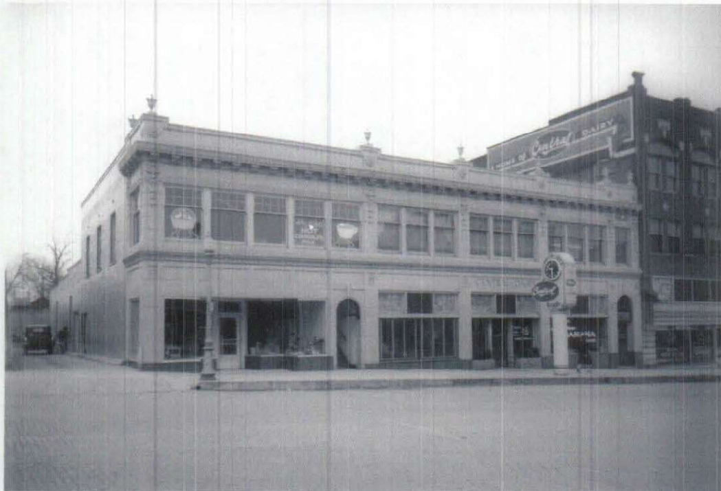
Figure Four. Photo of the building taken shortly after the addition was finished.

The expanded building had a pattern of use similar to that of the older portion; the Dairy utilized the ground floor and the second floor was rented out for offices. Also, as had been the case in 1930, one of the spaces was occupied by a photography studio. City directories show that another upper floor office was used by Roy Sappington in the early 1950s in association with his duties as the mayor.