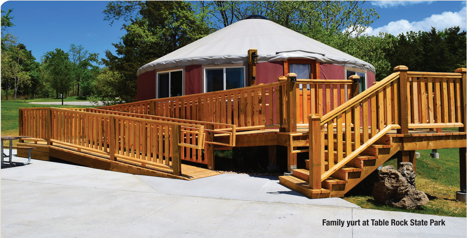
Family yurt at Table Rock State Park