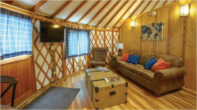
Premium yurt interior

The map below is a portion of Table Rock State Park's campground map, depicting the average percentage of occupancy per site for May through Sept. of 2020.