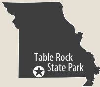
Table Rock State Park YURT PROJECT

Table Rock State Park features the first full-service yurt in the state parks system. This yurt has two bedrooms, bath, kitchen, living room, heating and air conditioning. The occupancy for this yurt has been extremely high since installation (See Example A). The proposed project is to add five additional full-service yurts to create the yurt village area in the park campground. The five 30' yurts would be installed on existing basic campsites.