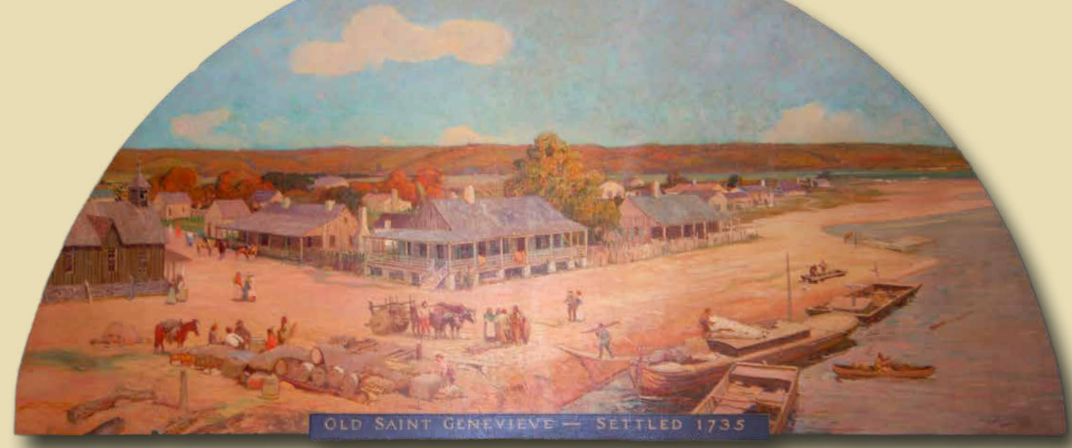
Oscar E. Berninghaus' depiction of Auguste Chouteau, (center in red coat) founding St. Louis on February 15, 1764, (above). "Old Ste. Genevieve—Settled 1735," lunette painted by Oscar Berninghaus for the Missouri State Capitol, (below). You can view the lunette on the second floor, west side of the Capitol.

"The Founding of St. Louis by Auguste Chouteau February 15, 1764," (top)