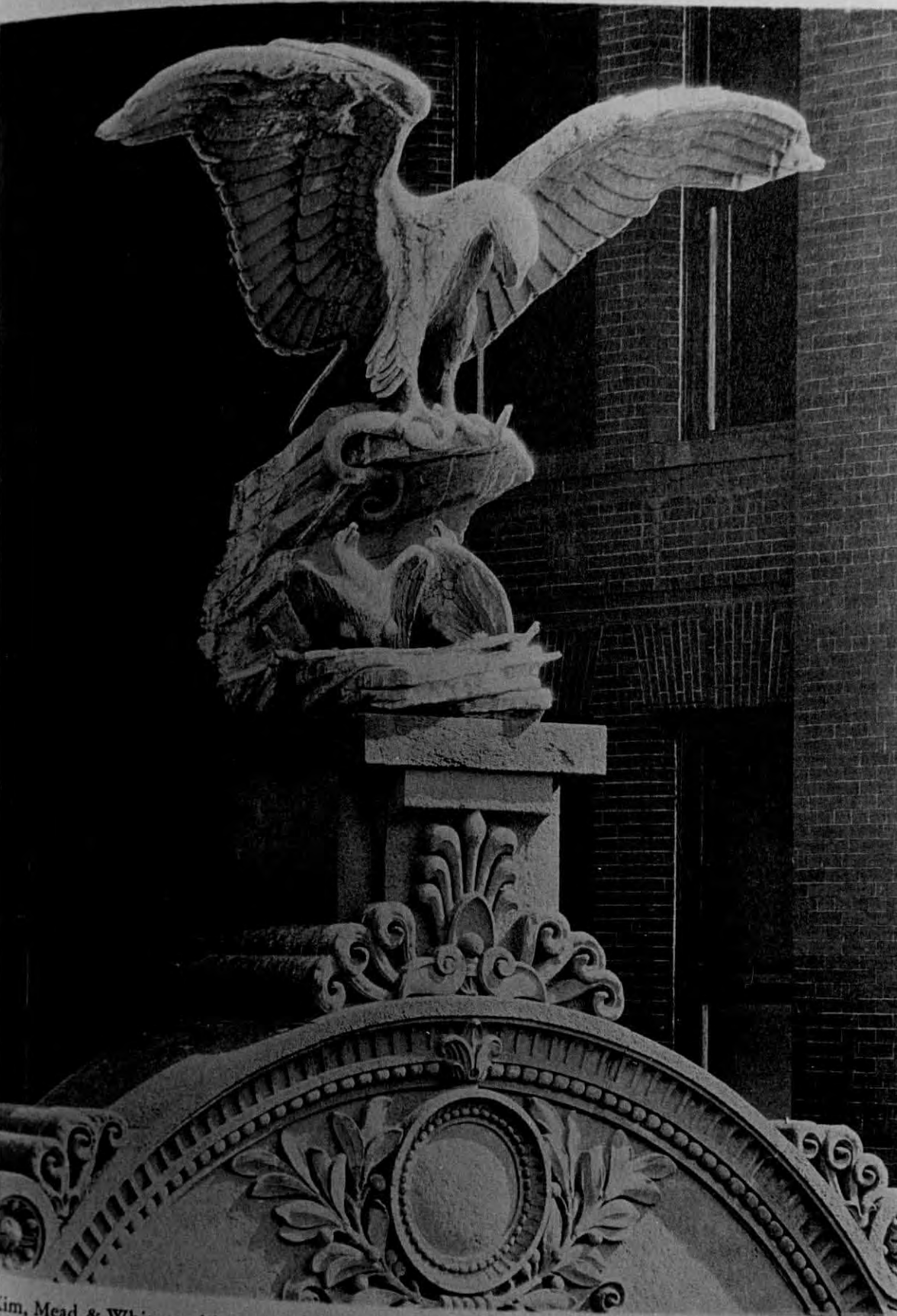
im, Mead & White, architects