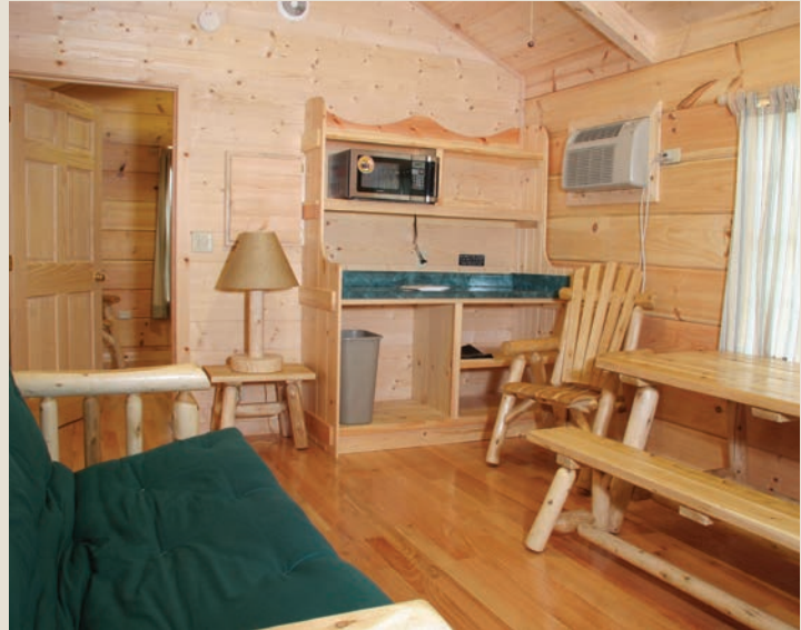
Camper Cabin Interior

Missouri state parks have featured camper cabins for more than 15 years. Camper cabins provide a low cost overnight opportunity for visitors that want to experience state parks, but might not own camping equipment, and are a very popular choice among families. The occupancy for camper cabins is consistently high around the state, demand exceeding availability. The camper cabins are placed on existing campsites and guests utilize the campground restroom and shower house facilities.