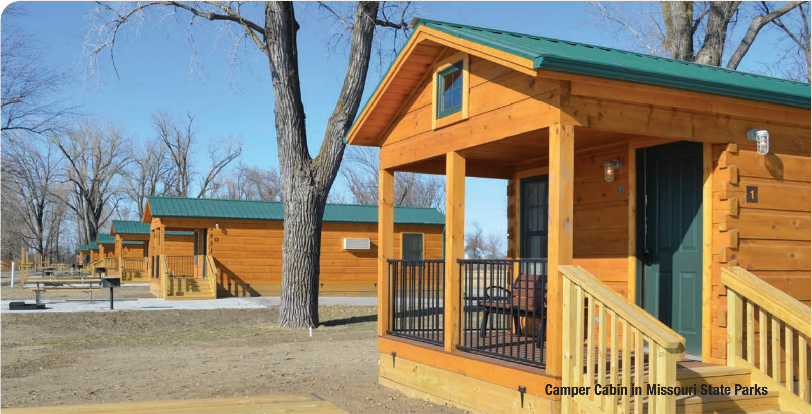
Camper Cabin in Missouri State Parks