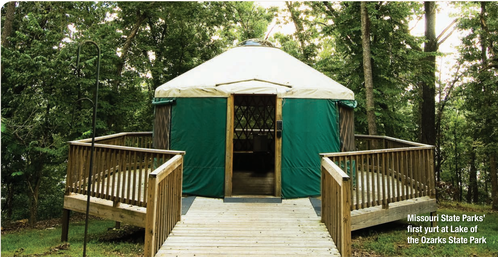
Missouri State Parks' first yurt at Lake of the Ozarks State Park