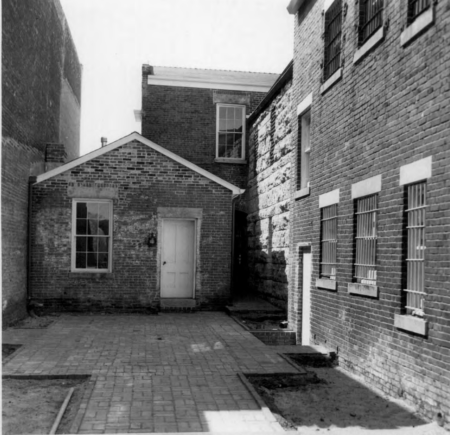
PART OF THE EAST ELEVATION OF THE MARSHALL'S HOME-THE SOUTH ELEVATION OF THE OLD STONE JAIL AND PART OF THE SOUTH ELEVATION OF THE JAIL ANNEX AND THE EAST ELEVATION OF THE MARSHALL'S KITCHEN.

PHOTOGRAPH # 16 Taken after the restoration of the project in 1959.