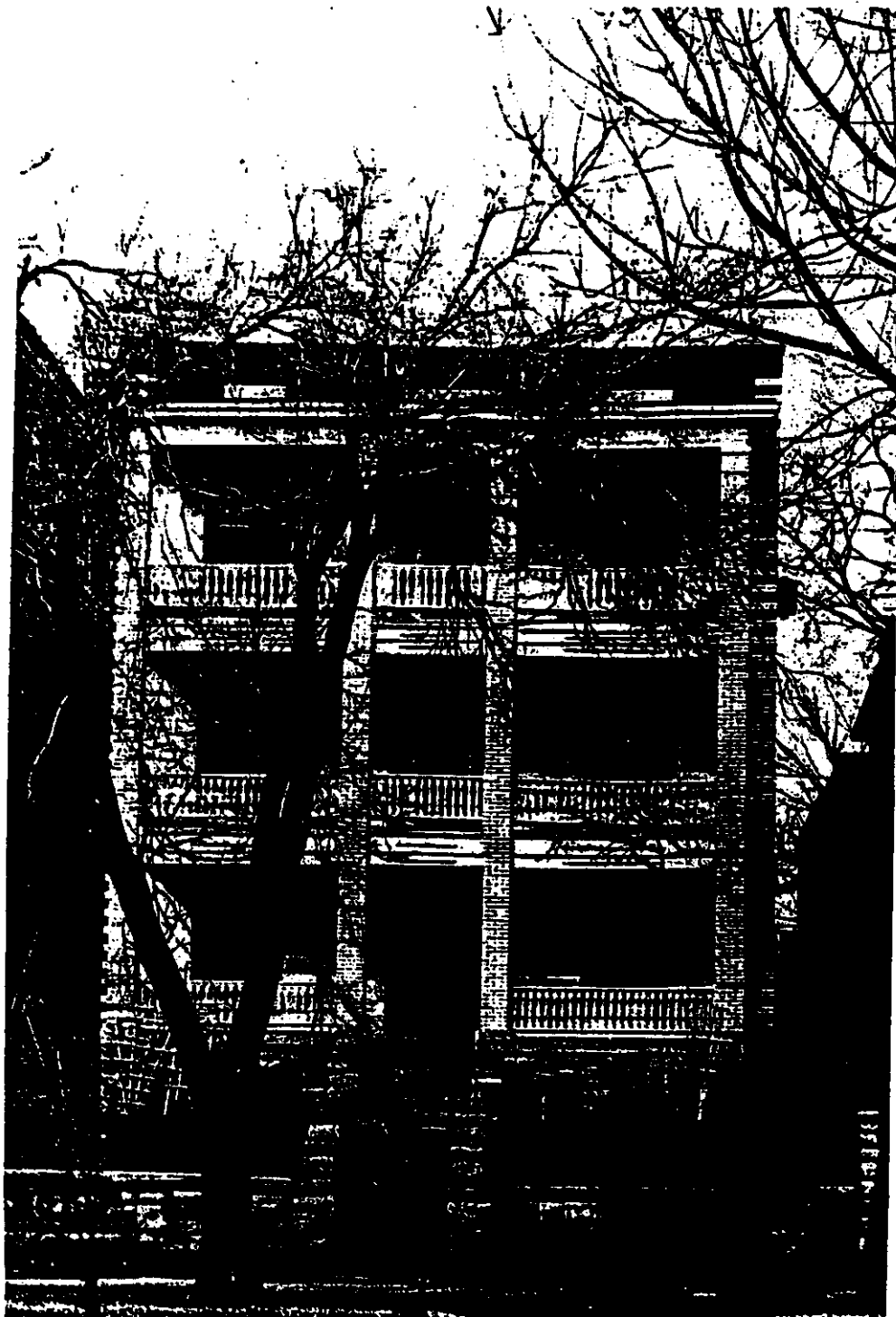
Figure 2. Photocopy of 1975 photograph of building, from 1975 drawings for HUD remodeling, William Johnson, architect

Apartment Buildings on the North End of The Paseo Boulevard in Kansas City, Missouri