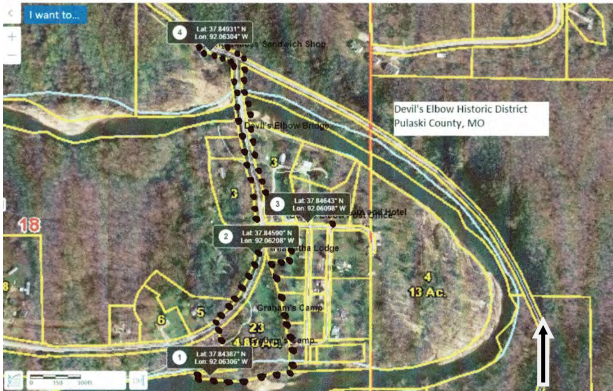
Map 2. Devil's Elbow Historic District Map illustrating map coordinates.

Name of multiple listing (if applicable)