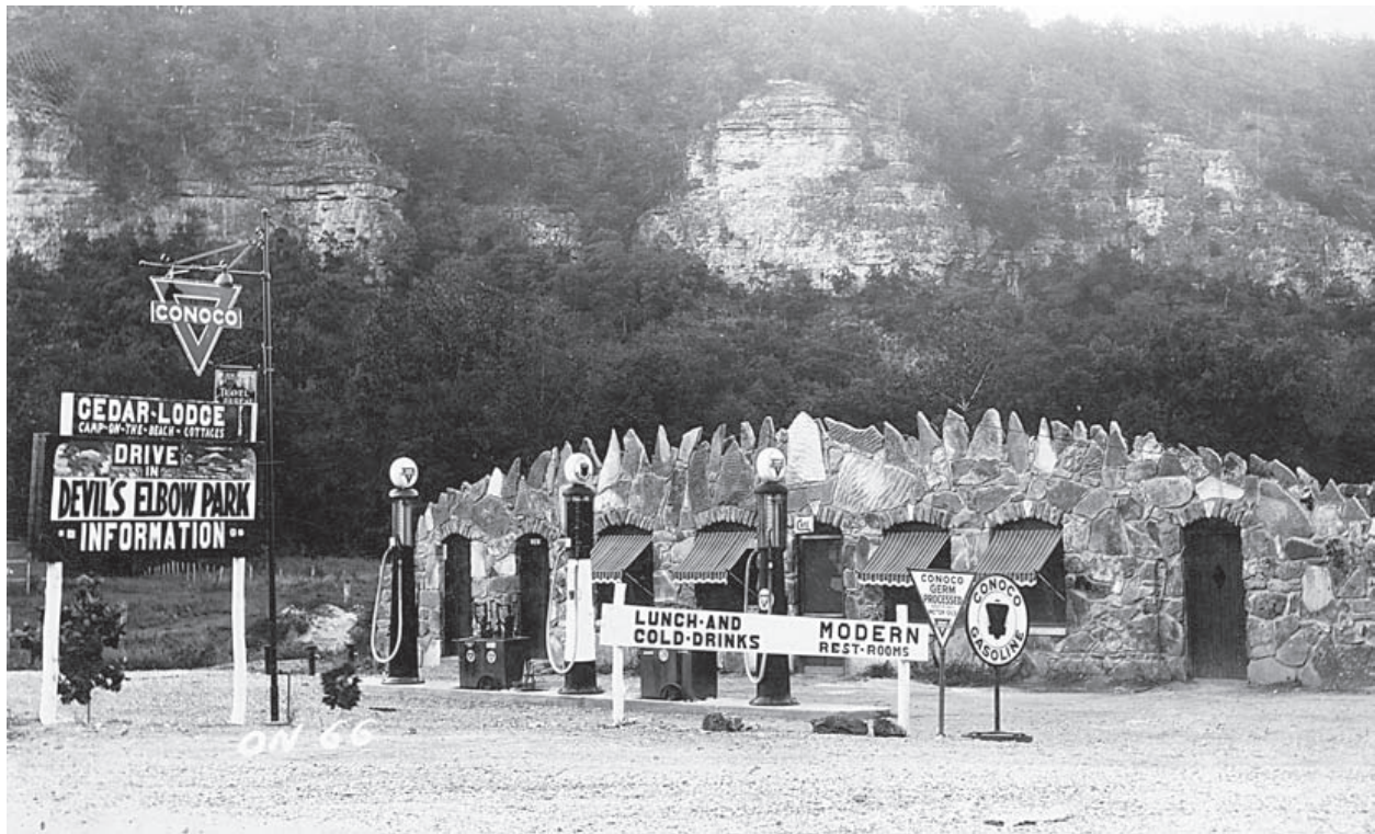
Figure 9. Devil's Elbow Café, 1931.

Name of multiple listing (if applicable)