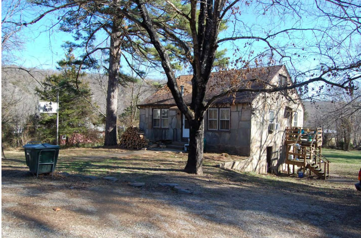
Figure 6. Current view (southeast) of property associated with Graham's Camp/Resort (aka Big Piney Lodge).

Name of multiple listing (if applicable)