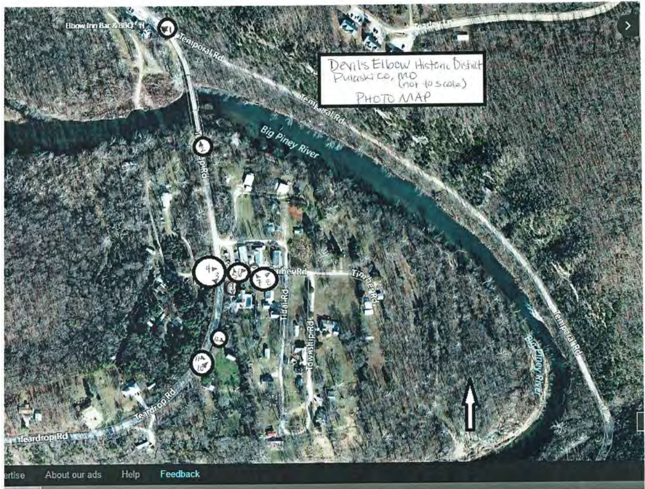
Map 1. Devil's Elbow Historic District Photo Map.

Name of multiple listing (if applicable)