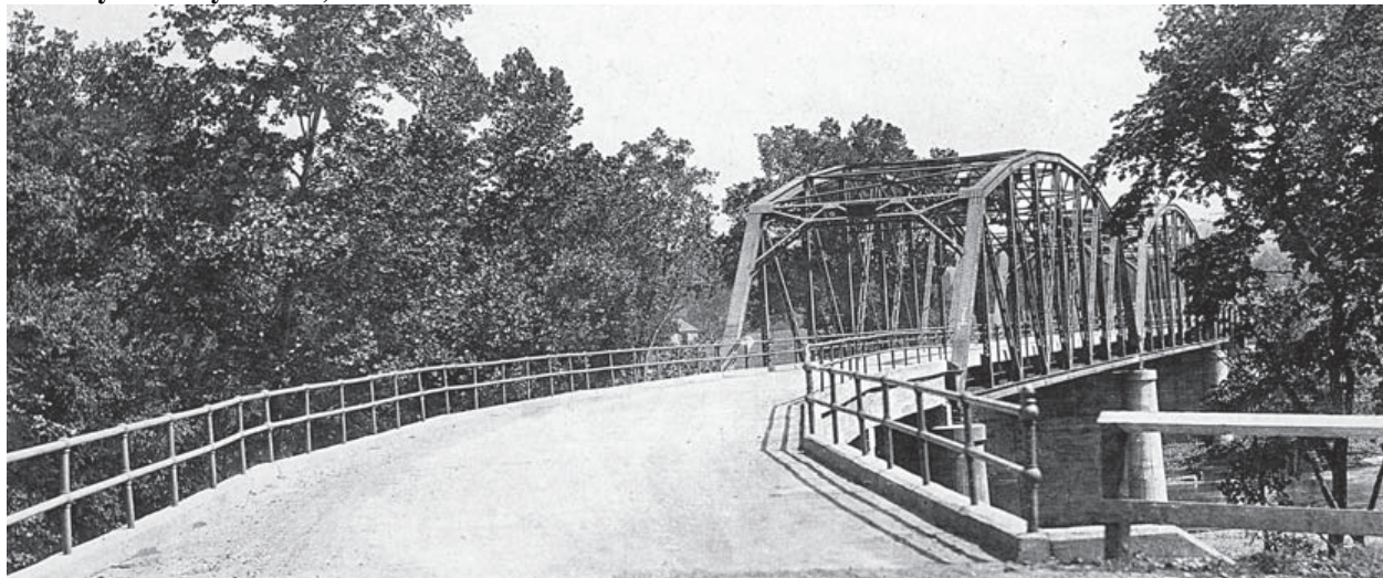
Figure 12. Devil's Elbow Bridge, c. 1930.