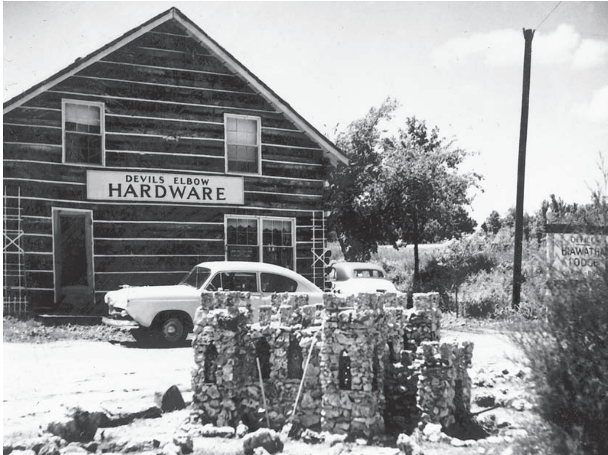
Figure 7. Hiawatha Lodge in 1953, when the building supported a local hardware store.

Name of multiple listing (if applicable)