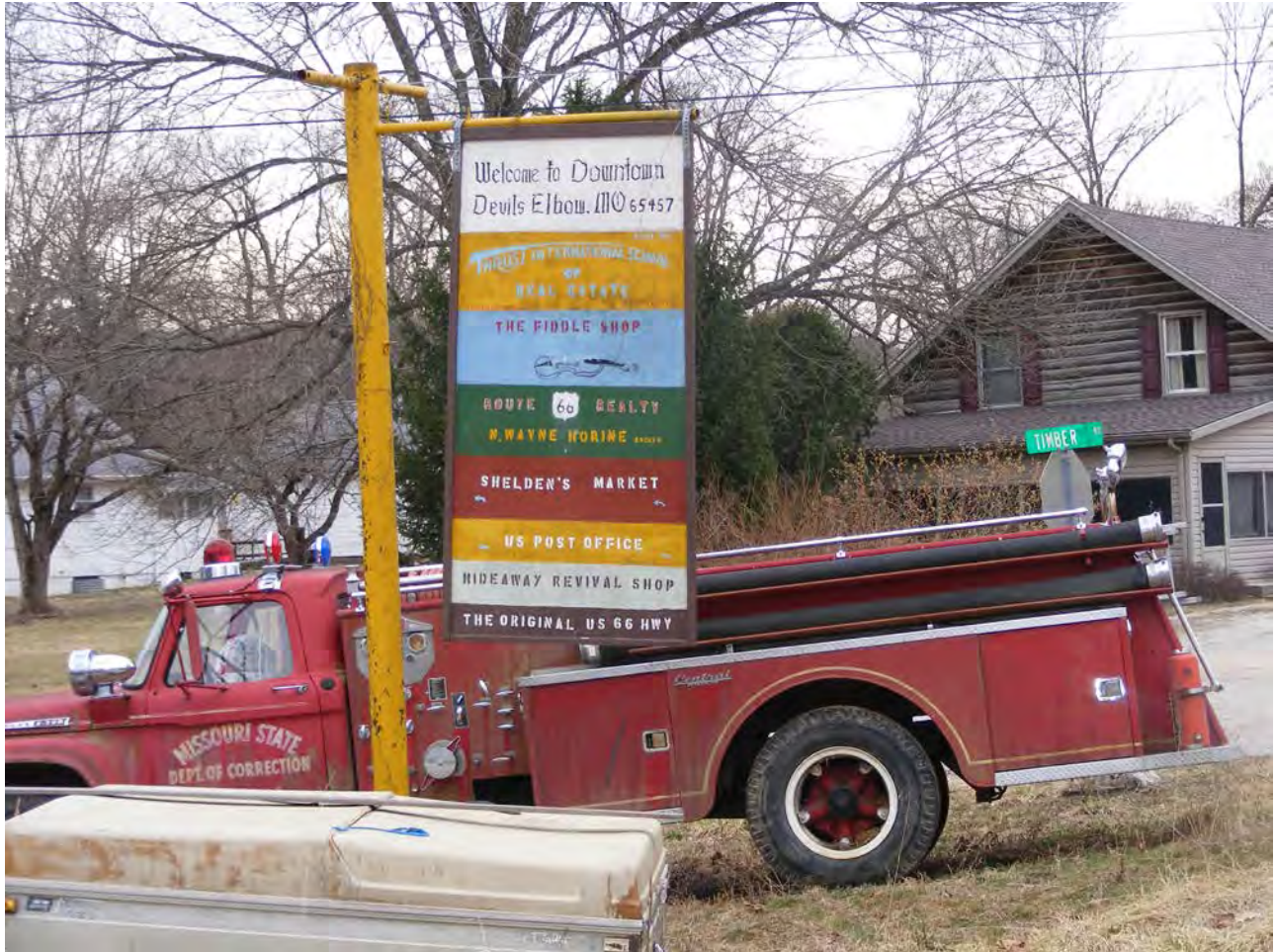
Figure 17. Current sign on the site of Devil's Elbow Café. (Photo, Ruth Keenoy, verified December 2015).

Name of multiple listing (if applicable)