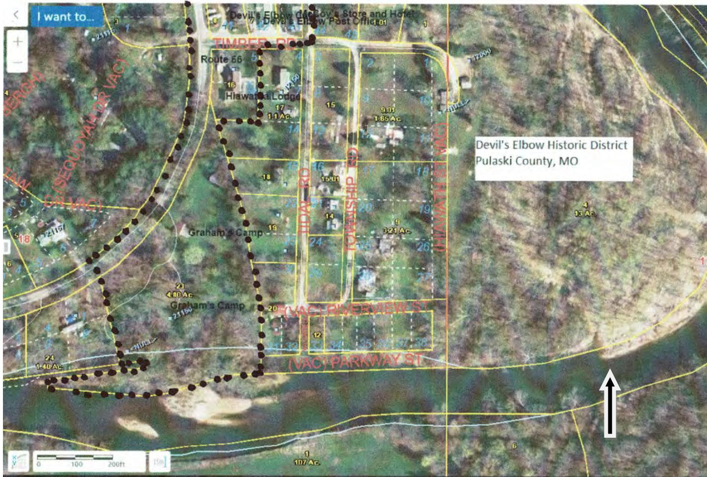
Map 5. Devil's Elbow Historic District Detail Map, south end.

Name of multiple listing (if applicable)