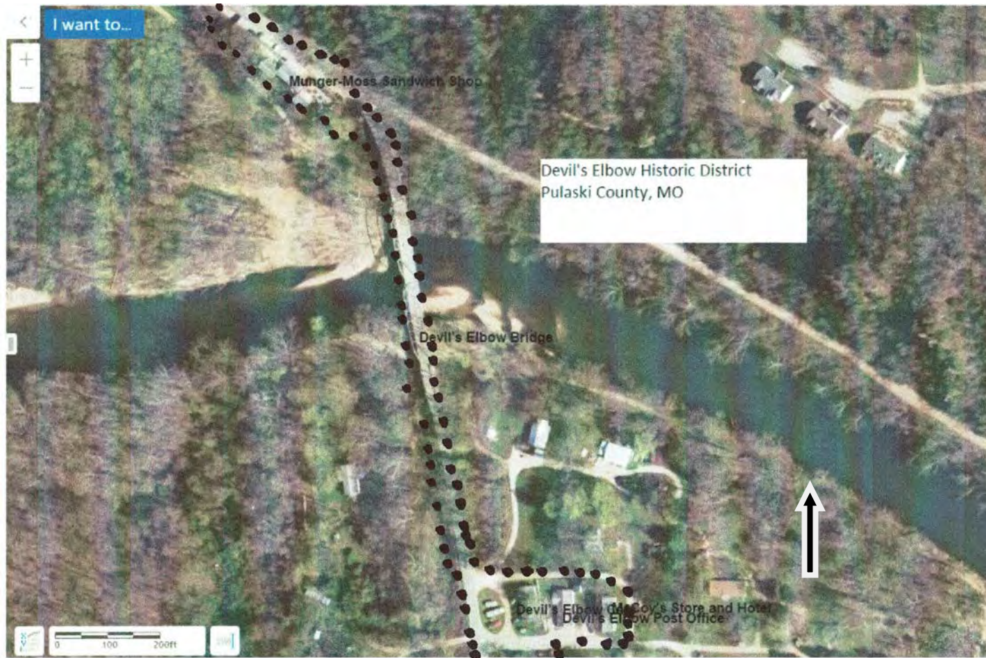
Map 3. Devil's Elbow Historic District Detail Map, north end.

Name of multiple listing (if applicable)