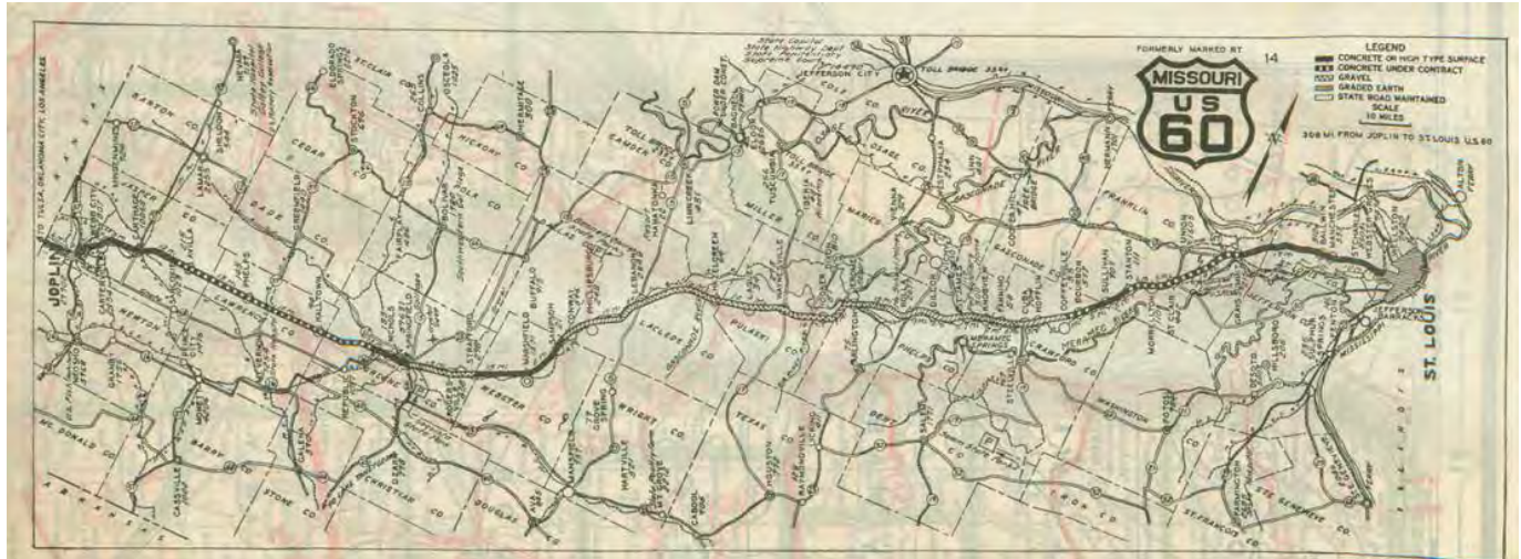
Figure 3. Note designation of "U.S. 60," initially intended to be the numbering for the federal highway. (Source: Missouri State Highway Map, 1926. Available at Landmarks Association of St. Louis, Inc., Map Files).

Name of multiple listing (if applicable)