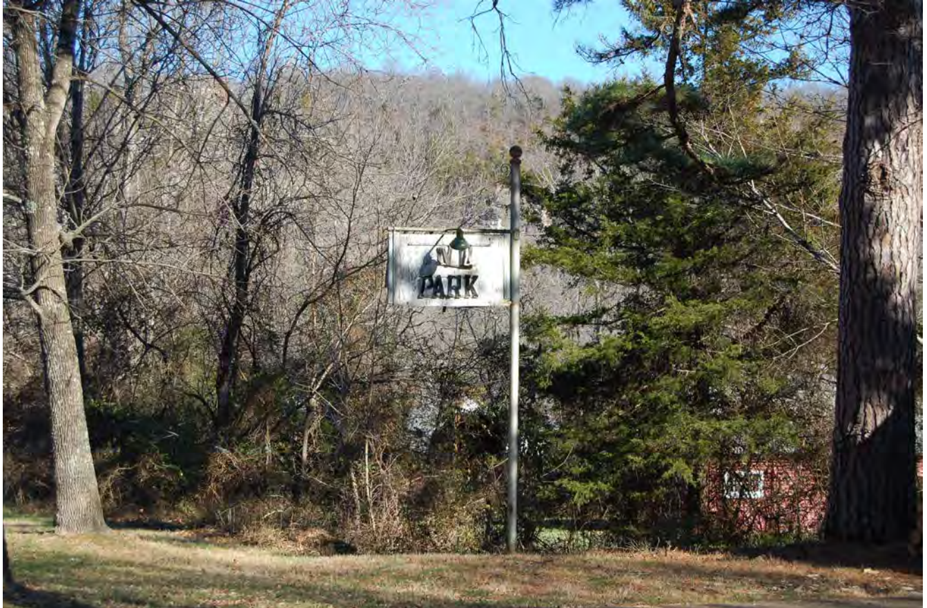
Figure 18, Sign, Graham's Camp. (Photo: Ruth Keenoy, December 2015).

Name of multiple listing (if applicable)