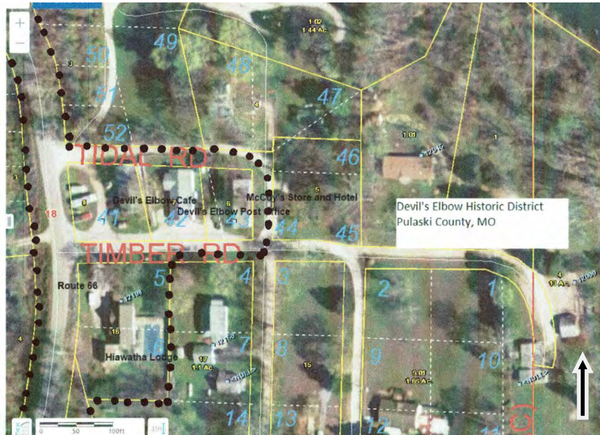
Map 4. Devil's Elbow Historic District Detail Map, center.

Name of multiple listing (if applicable)