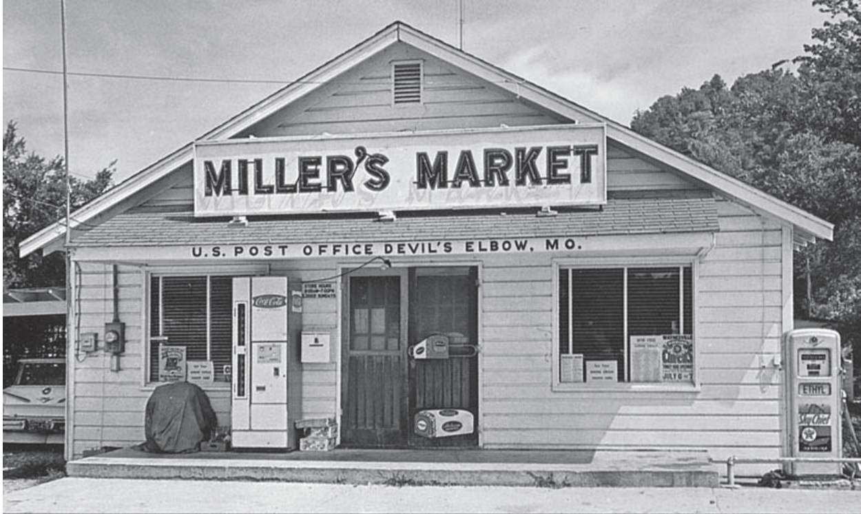
Figure 16. This Miller's Market postcard (postmarked 1971) is from a photograph taken during the mid-to-late 1950s. (Courtesy of Terry Primas).

Name of multiple listing (if applicable)