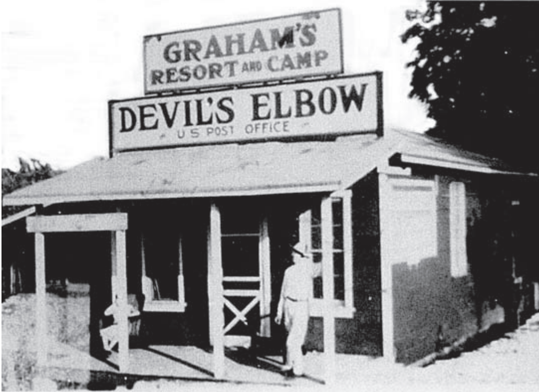
Figure 5. Graham's Camp / Devil's Elbow Post Office, 1920s, Courtesy of Terry Primas.

Name of multiple listing (if applicable)