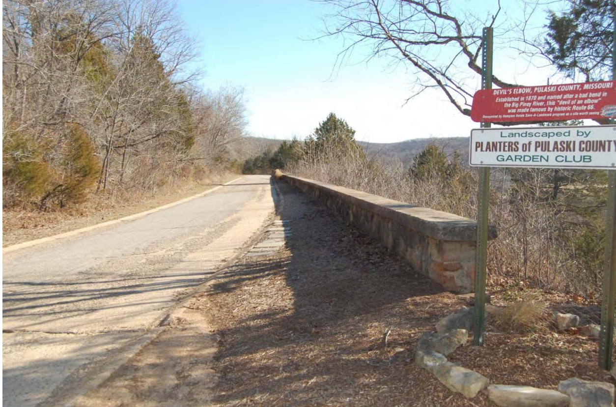
Figure 8. West of Devil's Elbow Historic District, along the original Route 66 alignment, this scenic overlook and stone wall were constructed by the Works Progress Administration.

Name of multiple listing (if applicable)