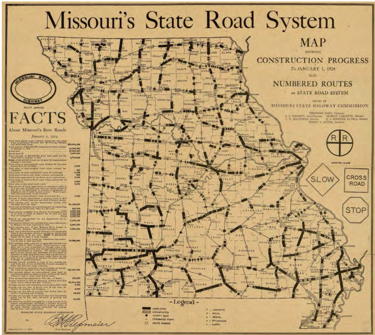
Figure 4. Missouri Highway Map, 1924.