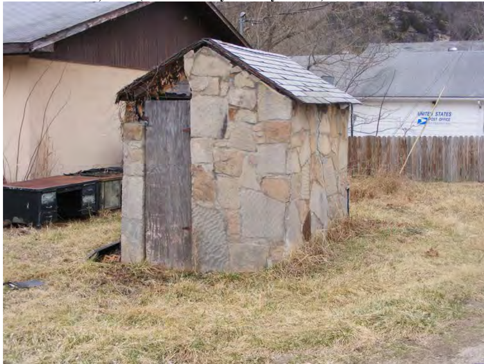
Figure 10. Pump House, Devil's Elbow Café. (Photo, Ruth Keenoy, verified December 18, 2015)