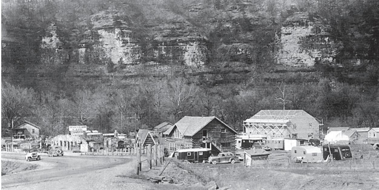
Figure 14. Devil's Elbow, 1942. Note that the two-story building is still under construction. The men working on the building rented the trailers in the foreground. Tourist cabins can be seen south of the two-story building, also owned by C.O. McCoy.

Name of multiple listing (if applicable)