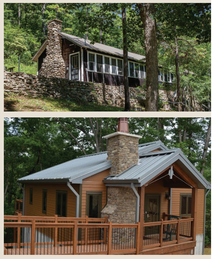
A dorm at Current River State Park (top) and a two-bedroom cabin in Missouri State Parks (above).

Project details are under development and the proposed schedule may be adjusted as needed. The total cost for each project is subject to change; costs and projected revenue are only estimates based on 2020 information.