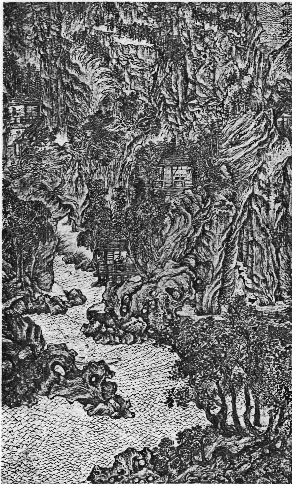
Colorplate 40. Scenic Dwelling at Chu-ch'u . By Wang Meng (c. A.D. 1309-1385). Hanging scroll, ink and color on paper, height 27\frac{7}{10} ". Yuan Dynasty. National Palace Museum, Formosa