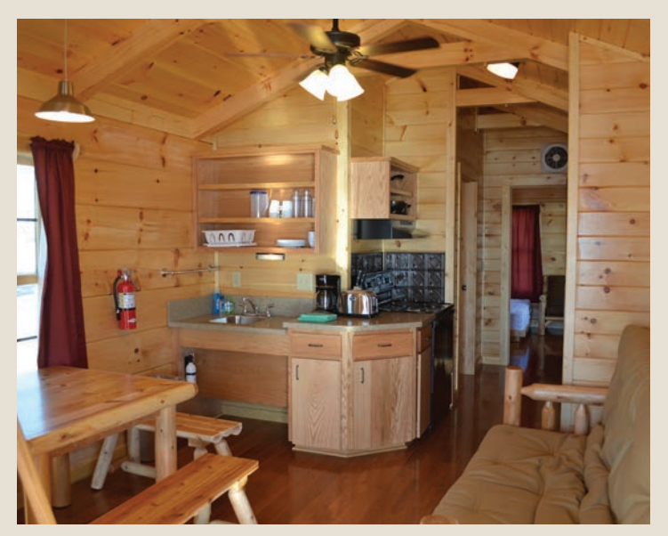
Camper Cabin Interior

Missouri state parks have featured camper cabins for more than 15 years. Camper cabins provide a low cost overnight opportunity for visitors that want to experience state parks. The occupancy for premium camper cabins is consistently high, demand exceeding availability. Camper cabins are a great option in flood prone areas because they can be easily moved to higher ground.