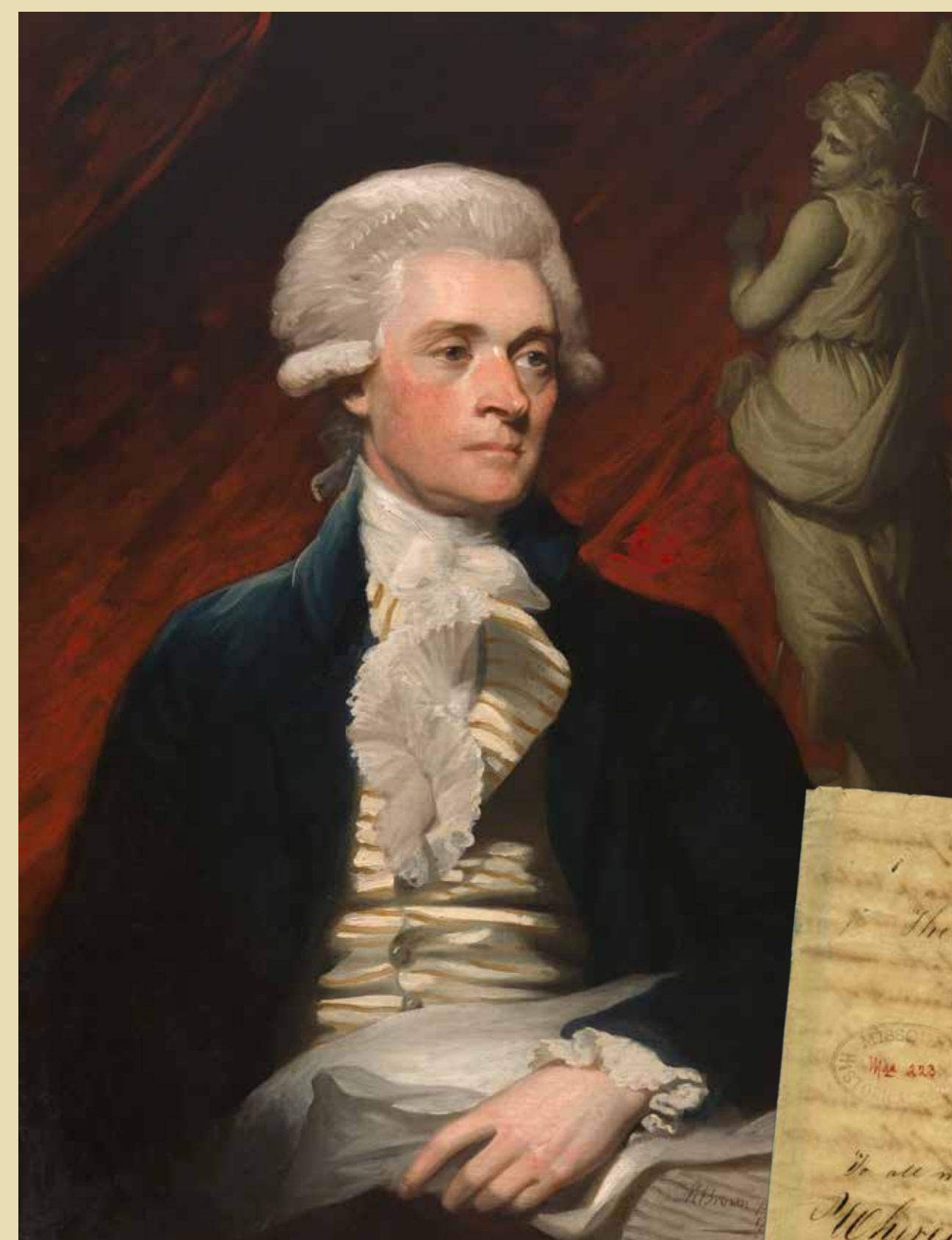
The Louisiana Purchase opened up the west to American settlement, displacing American Indians and bringing more enslaved people to the territory, including the Missouri area.

The purchase also brought an influx of European settlers and displaced American Indians from the east. Members of the Shawnee and Delaware tribes resettled in Osage territory. Conflicts emerged as the Osage saw their control over hunting ground weaken. In 1808, William Clark met with Osage leaders at Fort Osage in present-day Jackson County. There, the Osage signed a treaty giving up their lands, power and influence in Missouri in return for trade goods and access to a blacksmith and mill. With this treaty they lost much of their power and influence in the region.