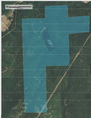
Property boundaries are approximate; boundary surveys are in process.