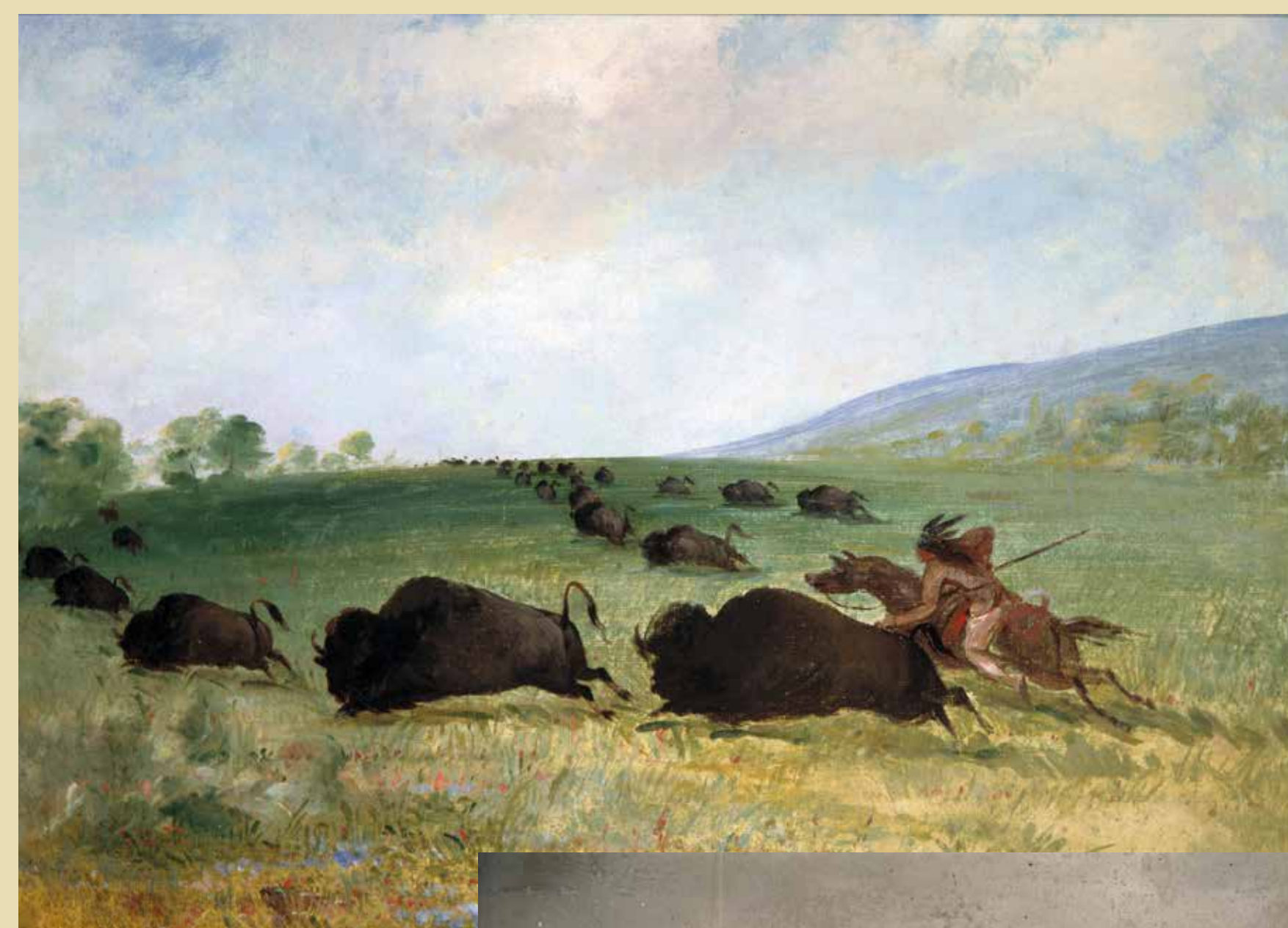
The Osage of Missouri traveled westward during the spring and summer to hunt bison. The arrival of horses to the region helped the men hunt more effectively. When they returned, Osage women butchered and preserved the meats and prepared the skin for other uses, (above).

When the French and Spanish arrived on the continent, it changed the lives of American Indians. New weapons, such as guns, metal axes and knives, and animals, such as horses, allowed for new ways to hunt and fight. However, they adopted European goods without adopting the culture. The downfall of Missouri’s original trailblazers began when the U.S. purchased the Louisiana Territory in 1804. Unlike the French and Spanish, the Americans intended to permanently farm the territory and build towns and cities. In less than 35 years, the U.S. government forced the removal of all Missouri’s native peoples.